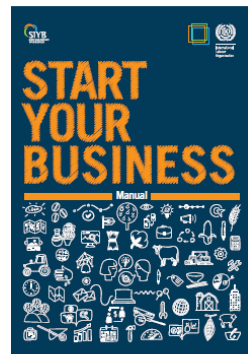
SYB Manual + Business Plan booklet