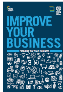
IYB Planning For Your Business + Buying & Stock Control + People & Productivity + Record Keeping + Marketing + Costing